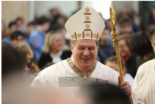
The Cardinal Bernardin Lecture: Cardinal Joseph Tobin, C.Ss.R., Archbishop of Newark

Some more highlights from our Spring 2020 Event Calendar: